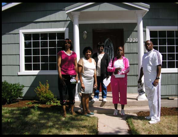
Tour of Homes by Club Members

On Saturday, August 23rd PCRI held a "Tour of Homes" for residents who are involved in our Homebuyer Club. Residents were able to see a number of homes that were for sale in North and Northeast Portland at reasonable prices. The Homebuyer Club meets once a month and provides support to individuals who want to learn how to navigate the home buying process. If you are interested in preparing for homeownership, call 503-288-2923.