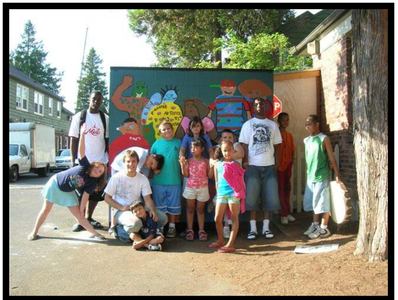
Mural painted by Maya Children