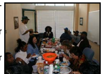
PCRI Staff Celebrate Thanksgiving

PCRI does not discriminate based on race, color, religion, national origin, familial status, disability, or legal source of income. We comply with all federal, state, and local laws concerning discrimination.