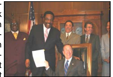
Signing of Bill 3054

Are you aware that a program exists that has helped thousands of people regain driver's license privileges, expunge minor criminal convictions and get back on track to gain or upgrade employment, housing and other opportunities. On Aug. 15, Governor Ted Kulongoski signed into law House Bill 3054 which provides $275,000, the first official funding for Project Clean Slate. Project Clean Slate re-opened enrollment September 1, 2007. If you have minor criminal convictions and court traffic fines and feel this program can benefit you, why not SEIZE THIS OPPORTUNITY to visit their website at www.projectcleanslate.com . A do-it-yourself packet is also available online.