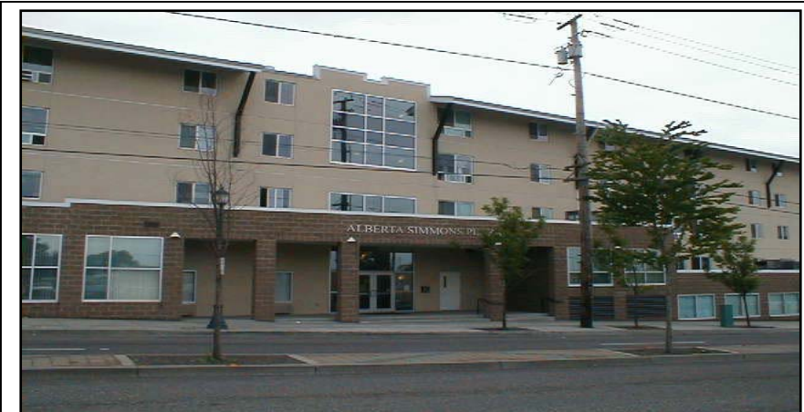
Alberta Simmons Plaza, located at 6615 NE Martin Luther King Jr. Blvd, is one of many affordable housing properties recently taken over by PCRI.

"Your attitude about who you are and what you have is a very little thing that makes a big difference." Theodore Roosevelt