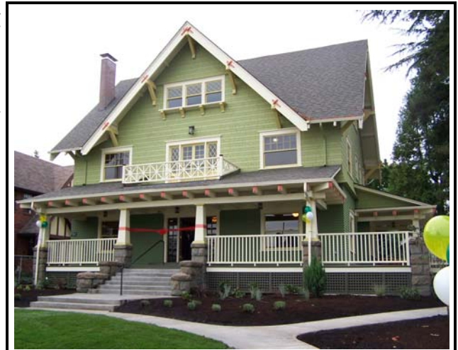
PCRI headquarters on Northeast Martin Luther King Jr. Blvd. sets an example for homeownership.

In the Community Development world, it is important to lead by example. As homeownership is important for our residents, it is also important to our Board and staff. Last year PCRI did lead by example, by moving into a home of our own. Last October, the staff moved into the new office, which happens to be an enormous house first owned by a local timber baron. Located on Martin Luther King Jr. Blvd., we are highly visible to the general public as well as to PCRI residents. As only the third owner in the 98 year history of the house, it was important to restore this building to its historic significance. Before the move, the office was completely renovated and restored inside and out. From new landscaping outside, to restoring the original stained woodwork throughout the interior, PCRI has shown that moving into homeownership is something to be proud of. Finally and most importantly, it sends a wonderful message to residents and potential residents, that they are welcomed and that PCRI considers them special and deserving of a wonderful place to call home. It sets the standards for the care and maintenance of the homes they live in. The new PCRI office represents the housing stability we hope all residents will feel and the promise of homeownership for all those who aspire.